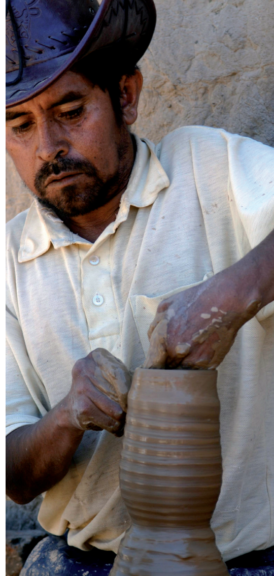
Traditional Earthenware.

FONPRODE has taken over the actions approved both by the former Development Aid Fund (FAD) –which are attributable to the Ministry of Foreign Affairs and Cooperation– and by the Microcredit Fund (FCM).